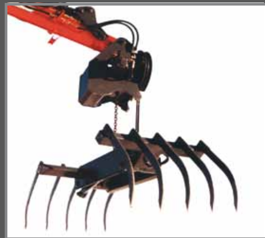
Chain drive for removal from deep silos