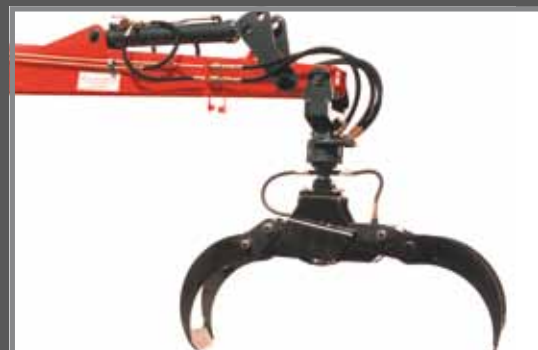
Timber clam (opening of clam: 1,290 mm)