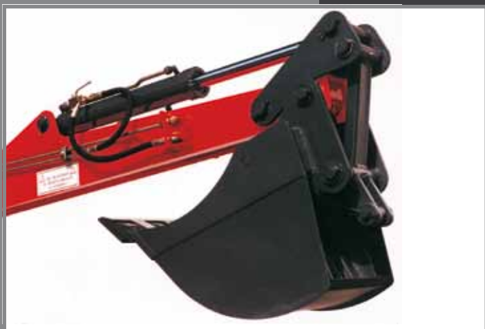
Dipper shovel with automatic control system for heavy soil