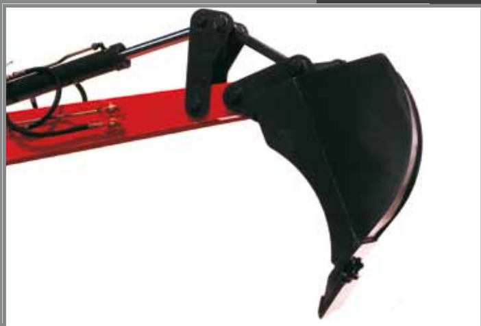
Dipper shovel with tine protection for leveling out and safe drainage