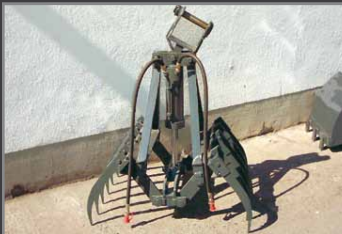
Dung clam, 2 x 6 tines with working cylinder