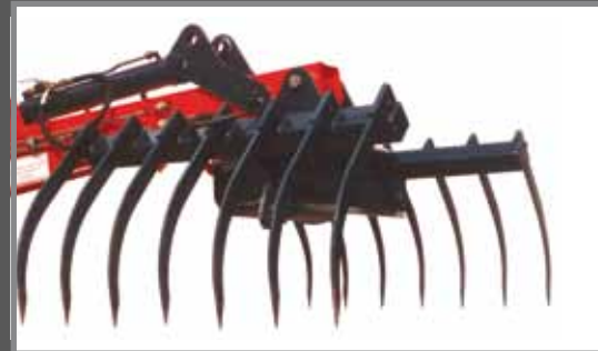
High capacity clam (opening width: 1,600 mm)