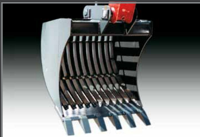
Dipper shovel for extraction of rootstocks, removal of stones from humus